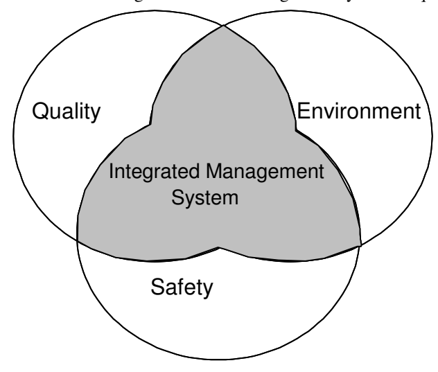
Fig.2. Schematic representation of an Integrated Management System (Santos, 2011)

Integration can be achieved at different levels, leading to partially or fully integrated systems. A partial integrated system keeps their manuals separated using, as far as possible, integrated procedures. A fully integrated system is based in a single manual that integrates unified management systems requirements.